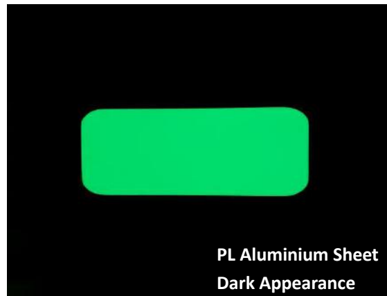
PL Aluminium Sheet Dark Appearance