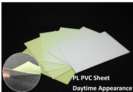
PL PVC Sheet Daytime Appearance